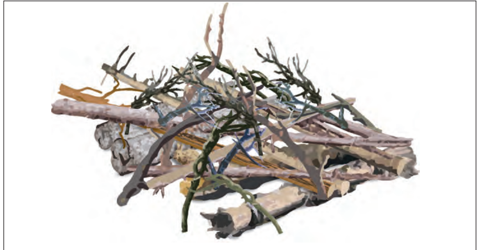
Figure 7. Habitat Piles.

Dense pockets of young conifers and shrubs provide quality habitat for many species, such as feeding or nesting habitat for songbirds. They also provide browse and cover for big game species. Patch retention in thinning units can provide this habitat, but requires forethought and follow through. Mark areas to be maintained in a denser state from 30-50 feet across, and at least the same in length, (preferably longer) to provide the “patchy and clumpy” mosaic pattern. These areas should be left un-thinned, (or thinned lightly), to maintain mid-level vegetation (shrubs and young trees) and provide sight distance cover for large mammals such as deer, elk and bear. Patches should be configured across the landscape to break long sight distances. Try to stagger patches at distances of 200-300 feet apart. Try to avoid more than 500' between clumps or patches. Retaining several patches or clumps will help deer and elk tremendously. Visual cover patches along roads and small ridge crests are extremely important.