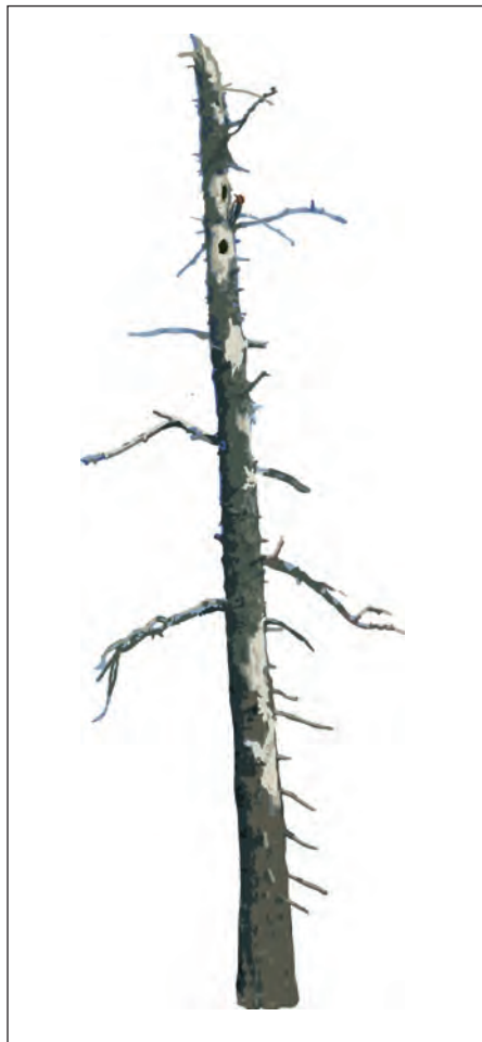
Figure 6. Snag tree.

Tip: Take advantage of harvesting equipment to make some snags. Mechanical harvesters can top trees, leaving 8-20 foot stumps, especially important if you are currently lacking in snags. Climbers can top some trees (creating jagged tops) or girdle 2/3 of the way up to make snags.