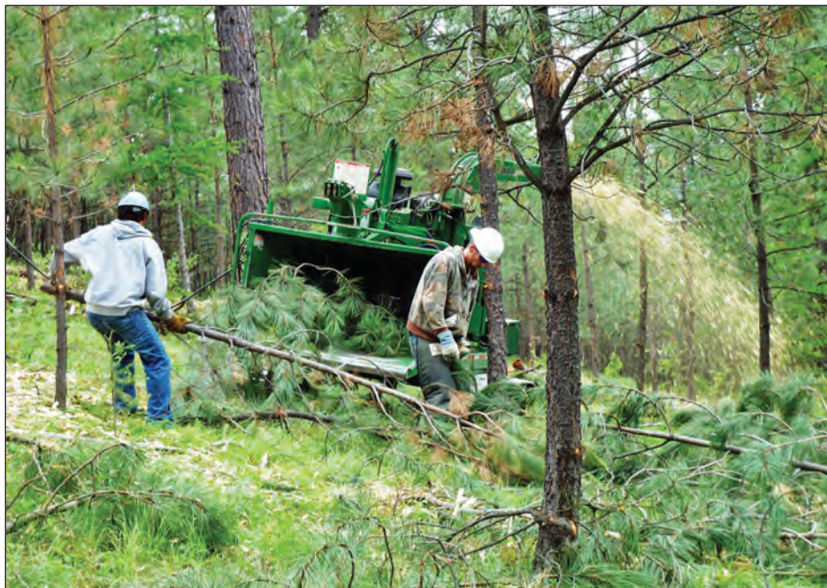
Making sure you properly dispose of slash from fuels reduction treatments is critical to reduce the chance of a beetle outbreak.

A publication by the Woodland Fish and Wildlife Group, 2016. Publications by the Woodland Fish and Wildlife Group are intended for use by small woodland owners across the Pacific Northwest. Some resources here are state specific, but should be generally useful to landowners throughout the Pacific Northwest.