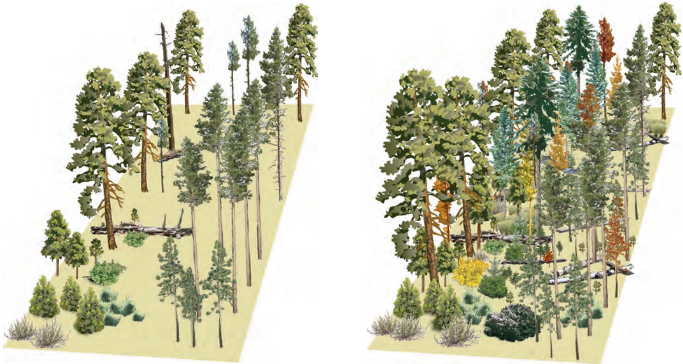
Figures 1 and 2. The figure on the left shows a historic forest that experienced regular low intensity fire. An individual tree here or there may have torched, but for the most part the fire stayed low. The figure on the right shows the same forest after decades of fire suppression. There is increased competition and reduced tree vigor, as well as increased risk for a high intensity fire. There is also reduced wildlife habitat value for some species in terms of forage and large healthy trees.

low intensity fires. Regeneration was often patchy, resulting in numerous openings and areas of dense young trees that might flash out in the next fire. Many shrub species would either re-sprout in clumps, or sprout from seed in the soil after a fire, creating a vigorous grass, forb, and shrub understory.