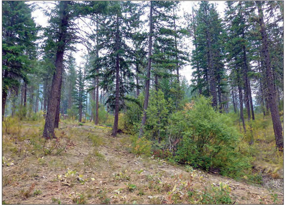
Small clumps left in this stand do not pose a hazard to remaining trees and provide important hiding cover.

Ultimately, you need to evaluate your personal risk, evaluate the trade-offs of different practices, and create a management plan for your property that meets your goals, your resources, and the scale of your property. We feel confident that the recommendations given in this publication can help anyone plan a fuels reduction project on their property that also provides improved forest health, aesthetics, and wildlife habitat.