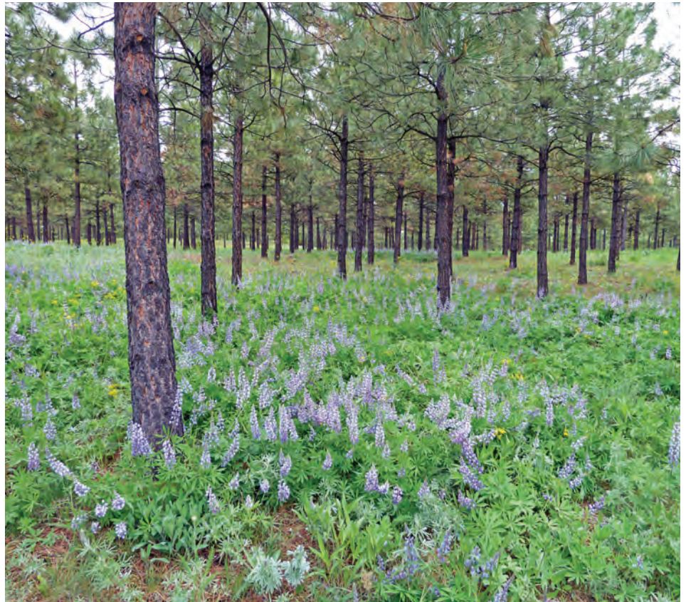
Figure 3b. This forest stand was evenly thinned and heavily mowed. Though it looks very tidy, it is now a very simple forest stand with limited wildlife habitat value.

news is that we don't have to choose one or the other. We don't have to sacrifice all wildlife habitat for the sake of fuels reduction, or vice versa.