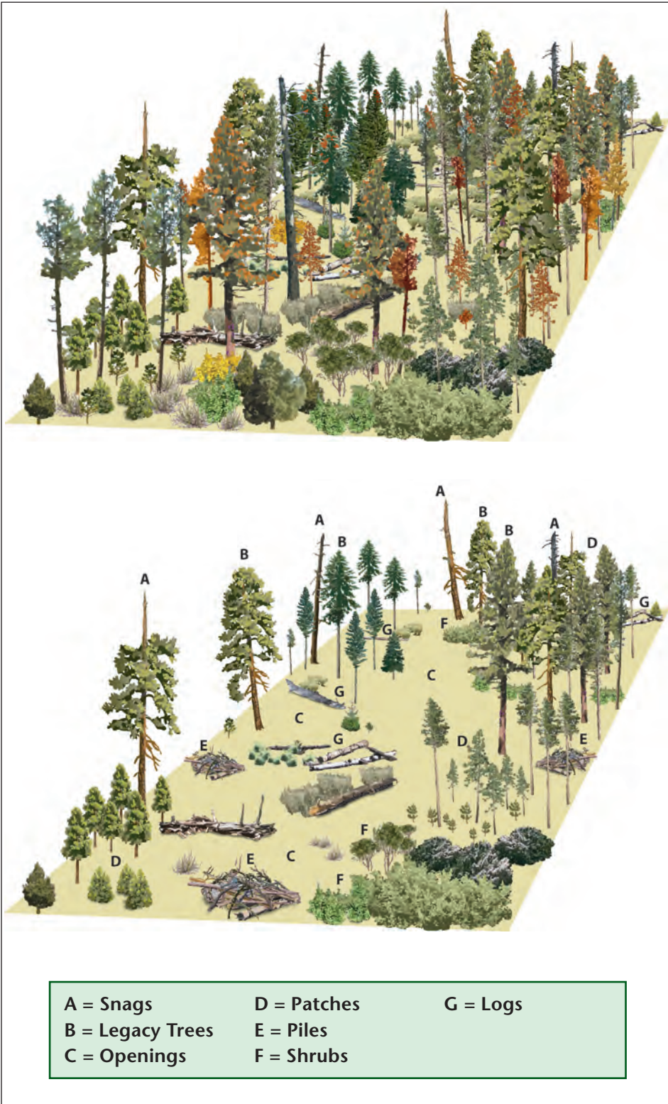
Figure 4 and Figure 5. Top, a forest from which fire has been removed for many years and is in need of restoration. Bottom, a forest treated to reduce fire risk, be more resilient to insects and disease, and enhance wildlife habitat. Components retained in the treated stand include snags, legacy trees, openings and patches.

Fuels Reduction Tip: Don't do the same thing everywhere. You want your forest to look different as you walk along your property (horizontal diversity) as well as when you look up and down (vertical diversity). Strive for a "Gappy, Patchy, Clumpy" forest.