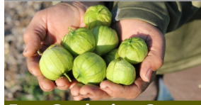
Free Gardening Course

If you know anyone interested in learning economical ways to grow vegetables, please let them know about Seed to Supper. Seed to Supper is series of 6 free classes that are open to the public. Classes are scheduled for Tuesdays from April 23 to May 28 from 6:00 to 8:00 pm at the Fish Food Bank. Registration is required (See sidebar). Topics include how to build healthy soil, plan your growing space, care for your growing garden, and harvest your bounty! Participants also get a free gardening book. Classes are taught by Central Gorge Master Gardeners.