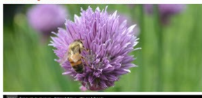
Central Gorge Master Gardener Association