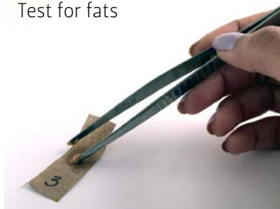
Test for fats