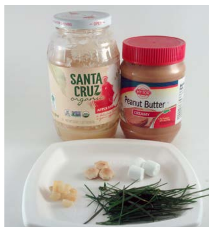
Students test these items for the presence of glucose, starch and fat.