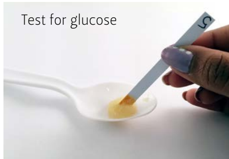
Test for glucose